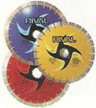
Granite City Tool's Rival Blades

2 are a graphite metal-bond to shape the stone, and positions 3 to 5 are a non-flexible resin diamond with Velcro to attach to a Velcro snail-lock head. A final buff position 6 is available if a higher shine is desired.